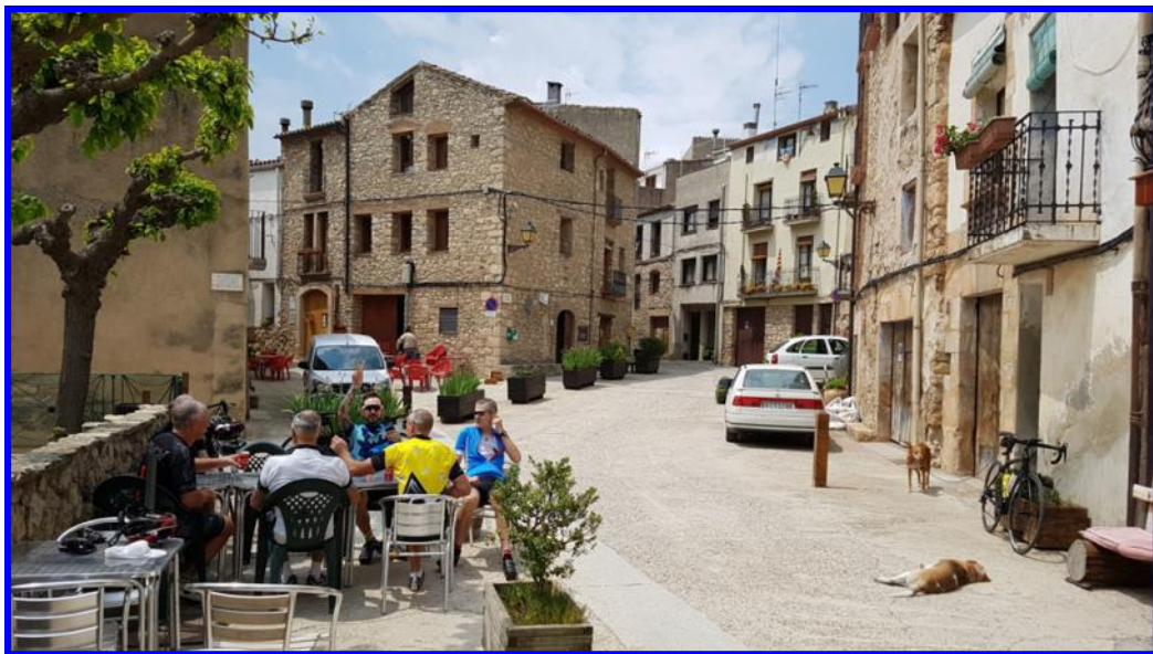
lunch stop in Arboli (who said cycling was a tough sport)