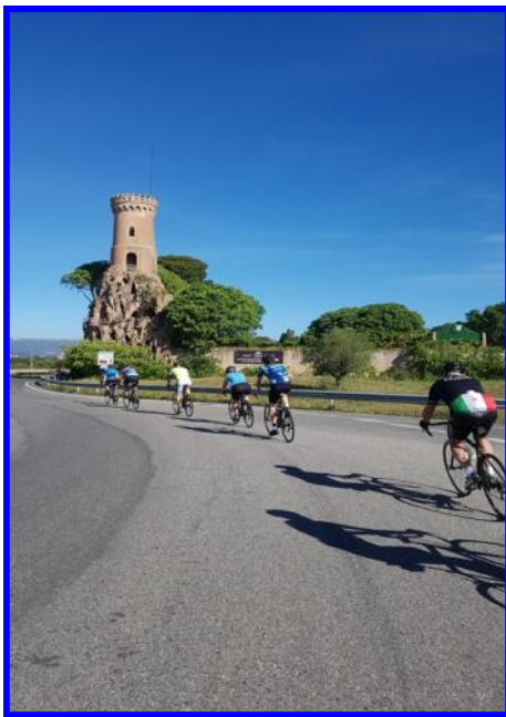
on the road to Montbrió del Camp

free of charge. The Hotel was again excellent, the rooms were cleaned daily and clean towels provided. The food was plentiful and varied, with some delicious fresh fruit. The hotel is ideally situated for our purpose, being a 10 minute walk to the bike shop and about 5 minutes to the sea front, cafes and supermarkets are all within a couple of minutes walk, there are some excellent cafes and bars in the town, also some award winning ice cream parlours (just ask Jack and Nathan, and me). It takes about 10 minutes to cycle out of the town to the main highway, from there on it is virtually traffic free.